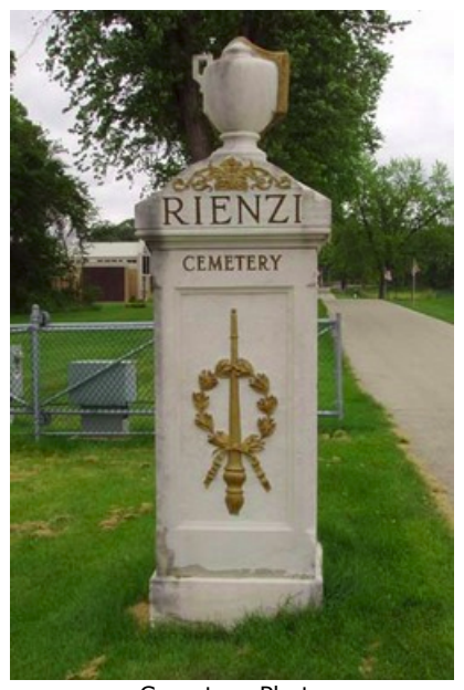
Cemetery Photo Added by: Ronald Rosenberg