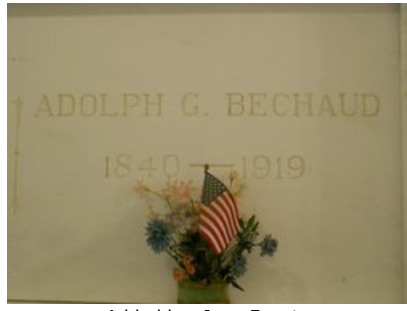
Added by: <u>Jean Fugate</u>