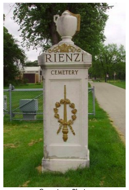
Cemetery Photo Added by: Ronald Rosenberg