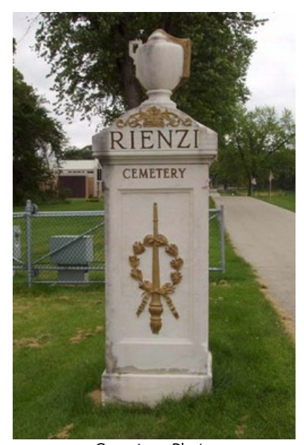
Cemetery Photo Added by: <u>Ronald Rosenberg</u>